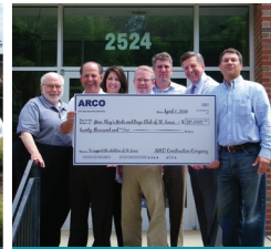
ARCO Construction Check Presentation