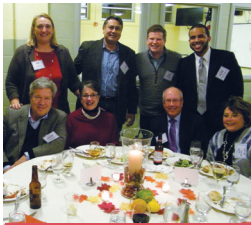
Inaugural Pillar Society Appreciation Dinner