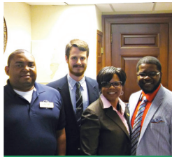
GSGBC Staff with Sen. Nasheed at Missouri Child Advocacy Day